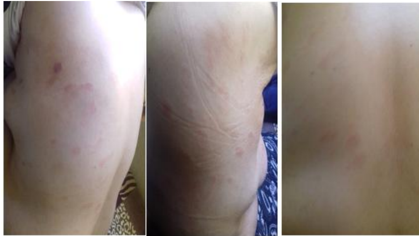
Fig-2: Eruption with erythematous lesions following on the trunk.