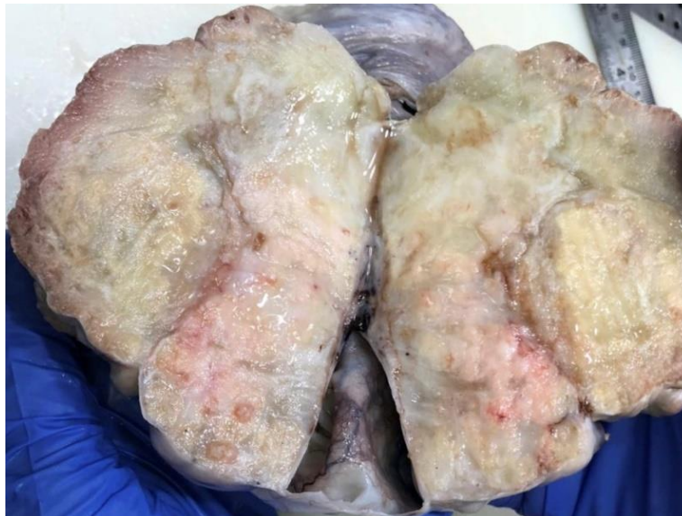
Fig-2: Cut section reveals yellowish white firm solid and Cystic areas