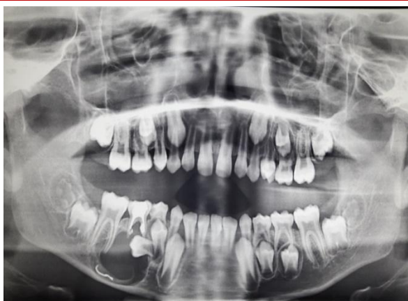
Fig-3: Pre-operative Orthopantomograph