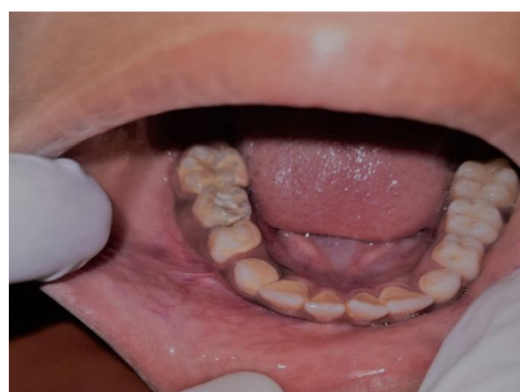
Fig-2b: Intraoral Clinical Photograph