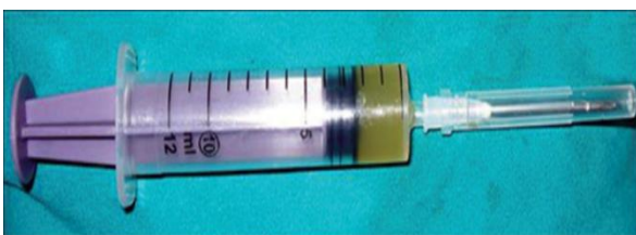
Fig-4: Fine Needle aspiration of the cystic fluid