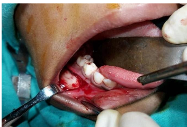
Fig-5b: Cystic Enucleation