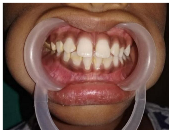
Fig-2a: Intraoral Clinical Photograph