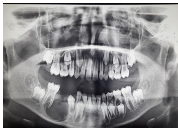
Fig-7: Post operative Orthopantomograph of 2-month follow up shows bone formation