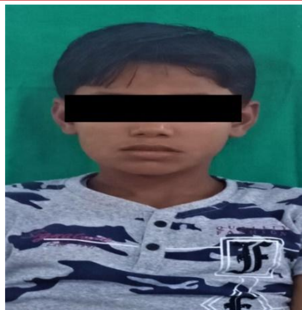
Fig-1: Extraoral Clinical Photograph

The specimen sent for histopathological examination. Connective tissue stroma was thick & fibrous and has been infiltrated with chronic inflammatory cells. Cystic lining has an epithelium of 4-6 layers cell thickness overlying the connective tissue stroma suggestive of inflammatory dentigerous cyst (Figure-6).