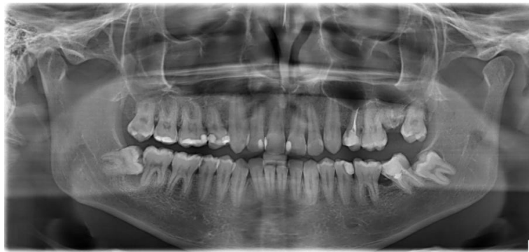
Fig-1: OPG before the extraction showing the badly broken #27

(sinus percussions) were given to the patient: to quit smoking, to avoid drinking from straw, avoid sneezing and mouth rinsing, in addition to use cold packs in the same day and warm packs for the next few days to overcome edema of the cheek. Patient was scheduled for a follow up visit after one week. In the follow up visit, patient presented with no signs or symptoms. Intra-oral examination showed a small nodule that is 1x1 mm in the buccal vestibule that appeared after the surgery and recession of gingiva around the distal root of the left maxillary first molar. Plan was to apply a desensitizing agent on the distal root and a recall visit after one month. In the recall visit, patient presented with no signs and symptoms, the surgical site was intact with no signs of wound dehiscence (figure11, 12).