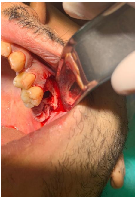
Fig-8: Intra-oral photo after periosteal reflection of the flap