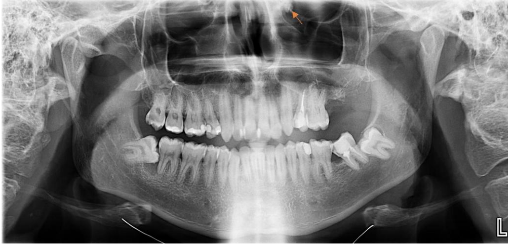
Fig-6: Preoperative OPG showing the displaced root fragment in the most medial superior position in the left maxillary sinus (arrow)