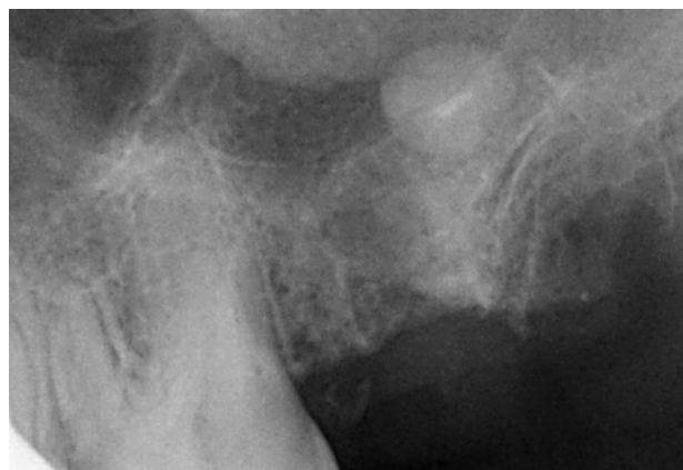
Fig-3: PA showing the fractured palatal root