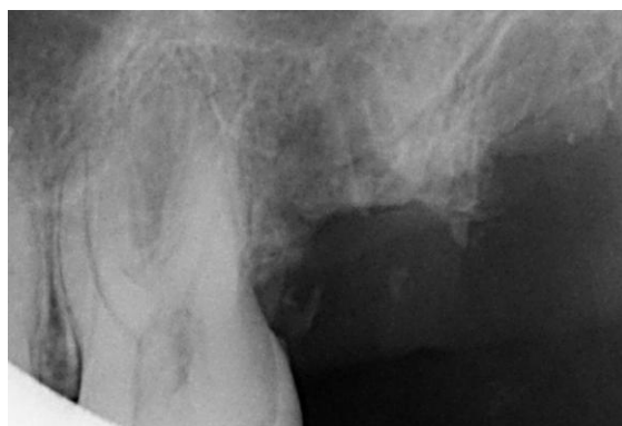
Fig-4: PA showing the root has displaced from the socket