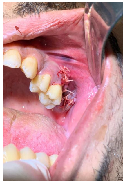
Fig-9: Intra-oral photo of the buccal advancement