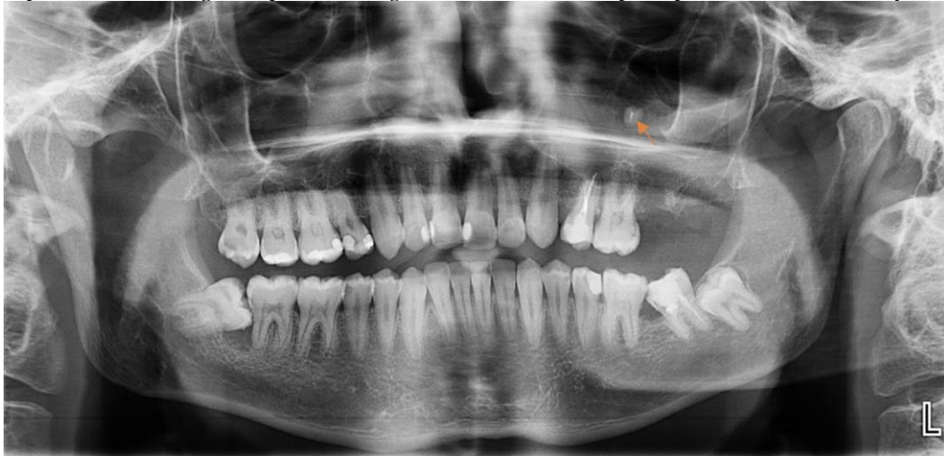
Fig-7: Intra-operative OPG after irrigation showing the root has moved from its previous position (arrow)