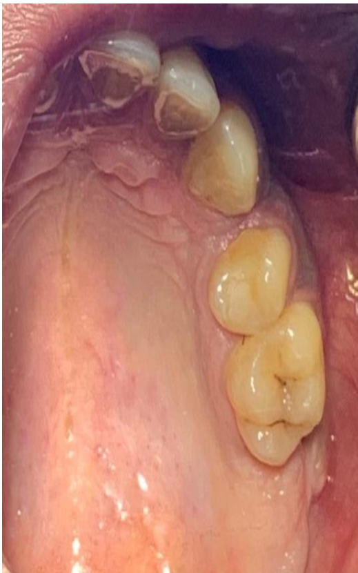
Fig-11: Occlusal view of the wound after healing