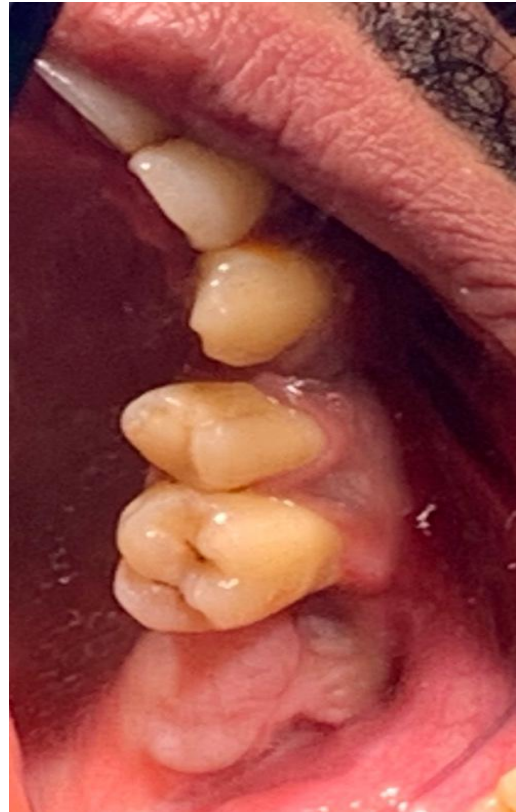
Fig-12: Lateral view of the wound after healing