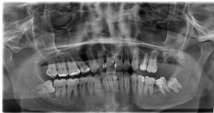
Fig-2: OPG showing the fractured palatal root in the socket