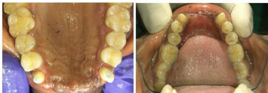
Fig-7: Teeth Preparation