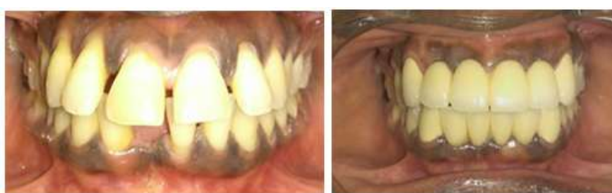
Fig-9: New Smile Makeover