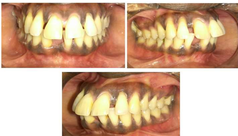
Fig-1: Pre Operative

Teeth preparation (Fig-7) was done to fabricate metal ceramic fixed dental prosthesis from upper right canine to the upper left canine and also from lower right canine to the lower left canine in the lower arch. Impression was made with poly vinyl siloxane elastomeric impression material. Cementation of definitive prosthesis (Fig-8) was done in the final visit using Glass ionomer cement. Post operative instructions were given. A one year follow up was done with no appreciable changes at the treatment site and the patient was fully satisfied with the improved aesthetic outcome (Fig-9).