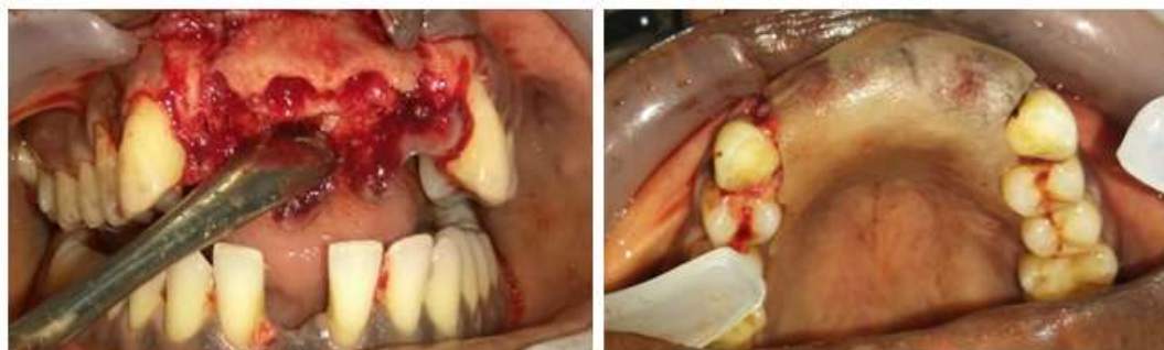
Fig-6: Deans Alveoloplasty and Verification Stent