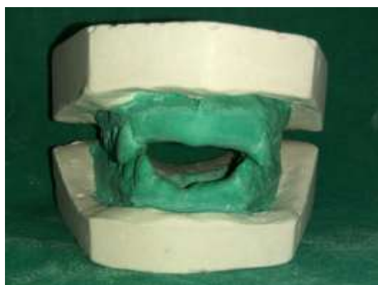
Fig-4: Mock surgery