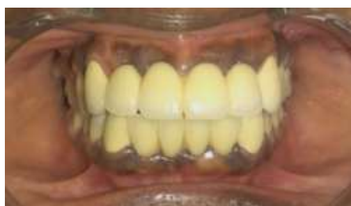
Fig-8: Final prosthesis