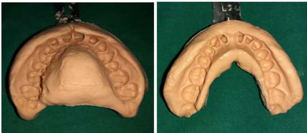
Fig-2: Diagnostic Impression