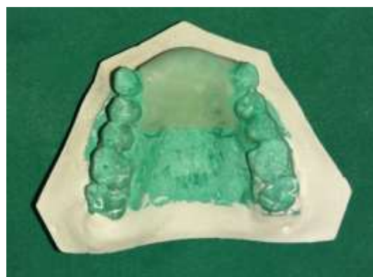
Fig-5: Surgical stent