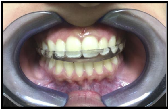
Fig-4: Full-coverage hard stabilization orthotic jaw appliance. It has a flat occlusal surface to allow uniform posterior and anterior contacts with the opposing teeth on closure [37]

relationships, and protect teeth and restorations from jaw clenching, causing potential fracture or attrition of dentition[37].