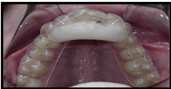
Fig-5: Anterior repositioning appliance, or MORA. Note the reverse anterior ramp (arrows) on the palatal section of the anterior segment of the device. It functions as a guide to place the mandible into a protrusive position [37]