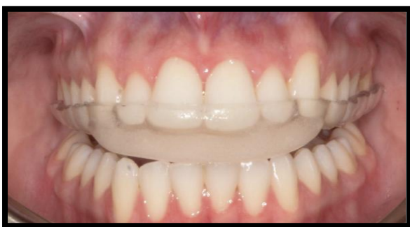
Fig-6: Full-coverage anterior bite appliance. This device allows only anterior teeth of the opposing arch to contact on closure