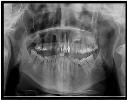
Fig-1: Panoramic radiography: important asymmetry between right and left mandibular condyle

degenerative bone changes (only in late stages; it is inadequate for the early detection of osseous modifications); asymmetries of the condyles, hyperplasia, hypoplasia, trauma, tumors.