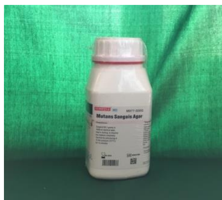
Mutans Sanguis Agar