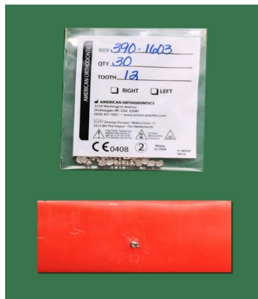
Stainless steel Bracket