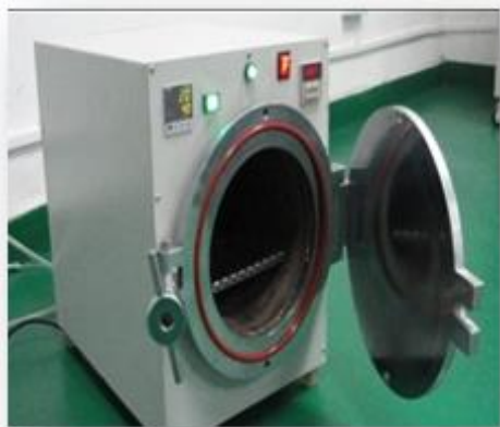
Sterilization of Diluted Agar Medium in Autoclave