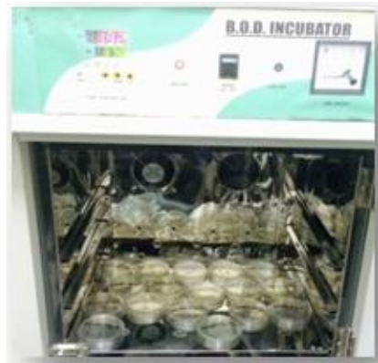
Petridishes Placed Inside Incubator