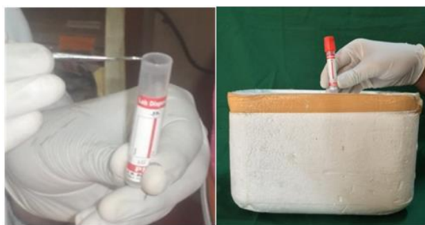
Ice Box Plaque Collection and Transportation