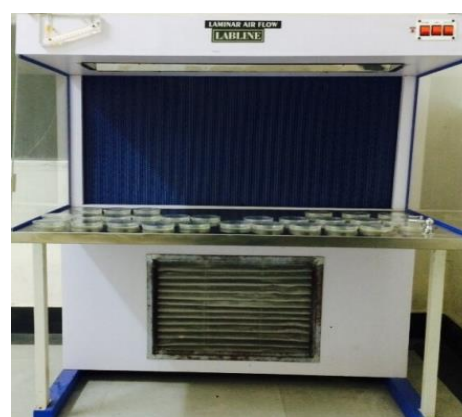
Laminar Air Flow