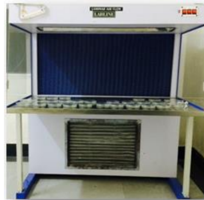
Solidification of Agar Medium in Laminar Air Flow