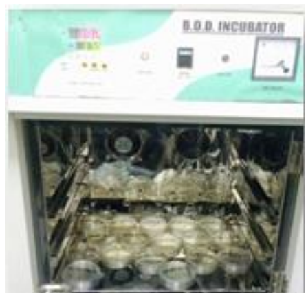
Petridishes Placed Inside Incubator