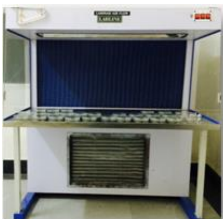
Solidification of Agar Medium in Laminar Air Flow