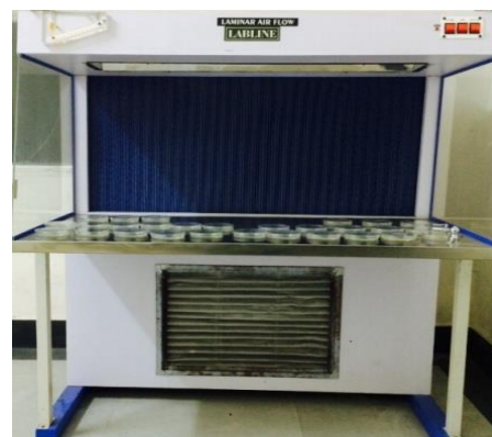
Laminar Air Flow