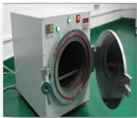
Sterilization of Diluted Agar Medium in Autoclave