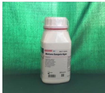
Mutans Sanguis Agar