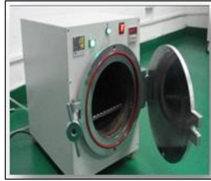
Sterilization of Diluted Agar Medium in Autoclave