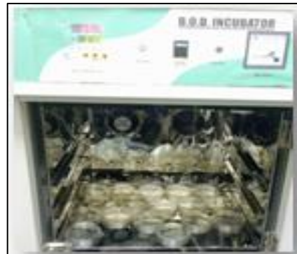
Petridishes Placed Inside Incubator