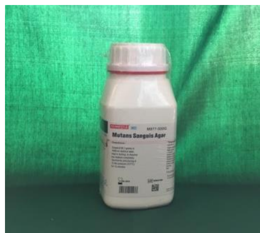
Mutans Sanguis Agar