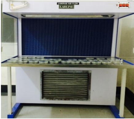
Laminar Air Flow