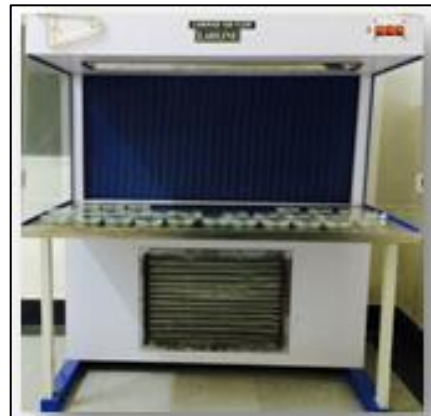
Solidification of Agar Medium in Laminar Air Flow