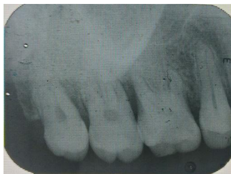
Fig-6a: 3 months follow up