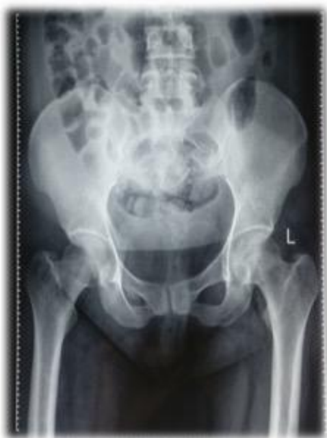
Fig-4a: X-ray of Hip