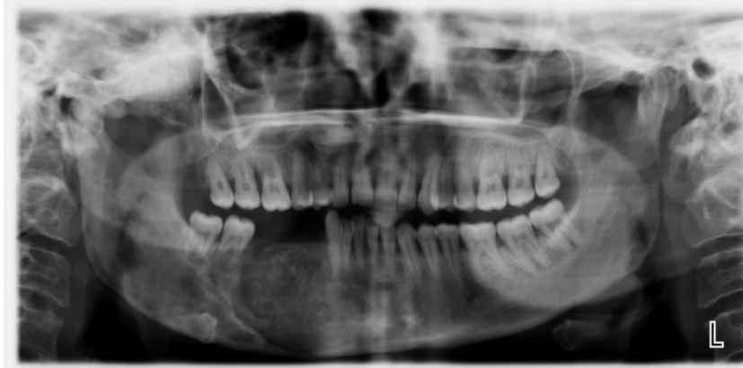
Fig-3: Orthopantomogram (OPG) revealing ground glass appearance in the region of 44,45 & 46