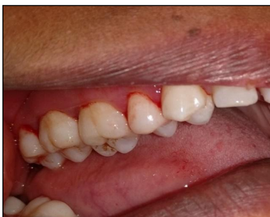
Fig-5d: Immediate Post Operative