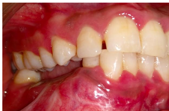
Fig-2a: Diffuse bicortical expansion (lateral view)