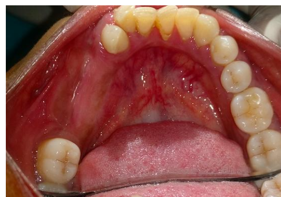
Fig-2b: Diffuse bicortical expansion (occlusal view)