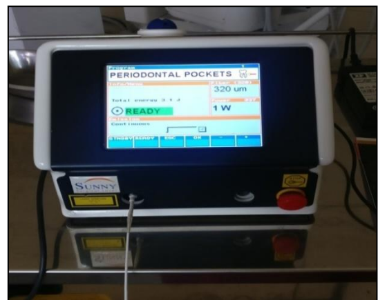
Fig-5a: Diode LASER Unit