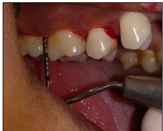
Fig-5b: 6mm probing depth (16)