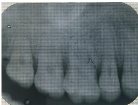
Fig-6b: 6 months follow up