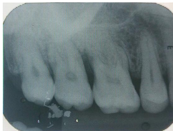
Fig-1: Angular Bone loss (distal to 16)

fibrin clot, which secures the pocket from detritus matter and to disinfect & close the mini-flap that was formed. The mini-flap was compressed against the tooth surface for 3-5mins for clot stabilization. Post surgical instructions was given including proper diet specifications along with oral hygiene instructions with an emphasis on continued periodontal maintenance. Patient was recalled at 3 days, 3months and 6months intervals and the periodontal pocket investigated showed significant improvement after LAPT (Fig 6a, 6b).