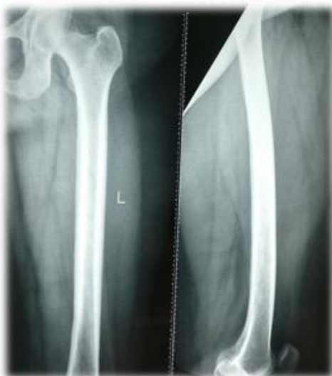
Fig-4b: X-ray of Femur