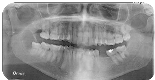
Fig-2: Orthopantomogram of a 34-year old men presenting a well-circumscribed, radiolucent lesion in the right posterior mandible, extending to the ramus and associated with the wisdom tooth

The orthopantomogram (OPG) showed a well-circumscribed, radiolucent lesion in the right posterior mandible, extending to the ramus and associated with the wisdom tooth Figure-2.