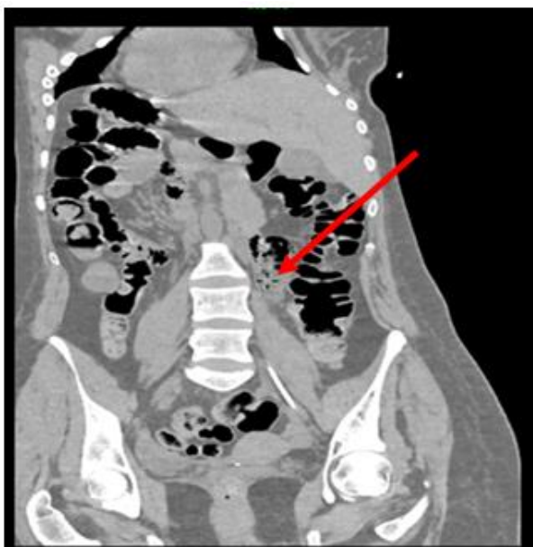
Figure 2: CT image showing a jejunal tumor process

The patient underwent an emergency operation and during the exploration a jejunal tumor was found 30 cm away from the Treitz angle; hence the realization of a bowel resection taking away the tumor with a latero-lateral mechanical bowel anastomosis (Figure 3).