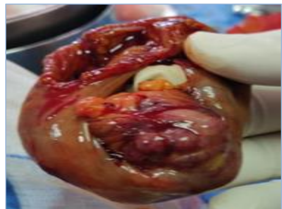
Figure 3: Operative Specimen of the jejunal tumor

The postoperative course was simple; the patient was discharged after one week of hospitalization; the anatomopathological study confirmed the diagnosis of jejunal Gist and patient did not received any adjuvant treatment.