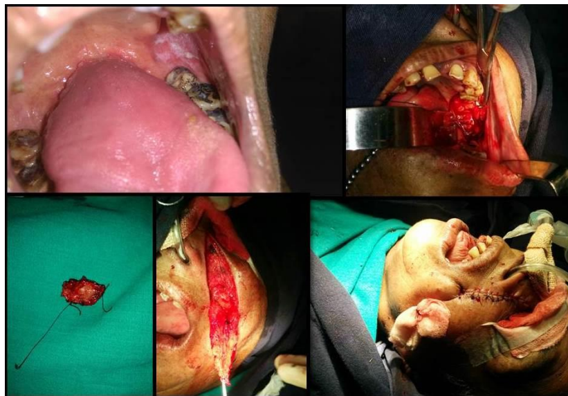
Fig-2: Clinical and Operative Pictures including excision and reconstruction

for the same confirmed dysplastic changes on one side and carcinoma in situ on the other side confirming for oral proliferative verrucous leukoplakia as per the criteria given by Cerero-Lapiedra et al. [20]. On the basis of preoperative work-up, we performed wide local excision with safe margins along with reconstruction of the defect by nasolabial flap by tunneling it, at a later stage the donor flap was resected once it was well taken up at the local site. The defect reconstruction was utmost important to prevent the morbidity of the local site (fig 2).