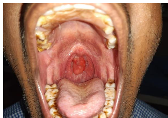
Fig-1: Pre-op picture of Nasopharynx

A 35 year old male paddy cultivator from a village in Maharashtra came to our out patient department with complaints of foreign body sensation in throat since one month. Patient did not give any history of respiratory distress, pain, oral bleed, hemoptysis or change in voice. On detailed history, it was discovered that the patient is a known case of hypertension since 6 years and was on medication for the same. It also came to our notice that the patient is suffering from recently diagnosed Stage IV chronic kidney disease.