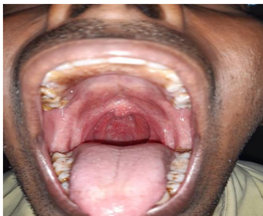
Fig-4: Picture on follow up two weeks after the surgical excision of the nasopharyngeal mass

Gross examination of the surgically excised tissue showed polypoidal mass measuring 3cm x 1.5cm x 1cm size with glistening external surface and whitish cut surface.