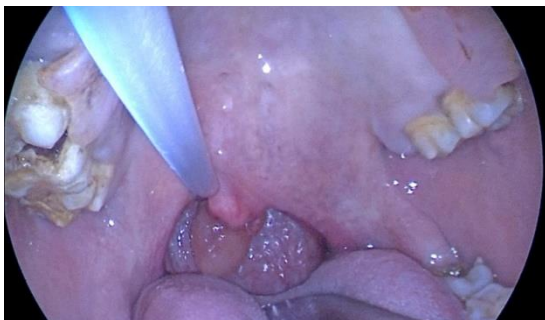
Fig-2: Intra-operative picture of the nasopharyngeal mass

Nasopharyngeal mass excision was done and the base was cauterized, and the tissue excised was sent for histopathological examination.