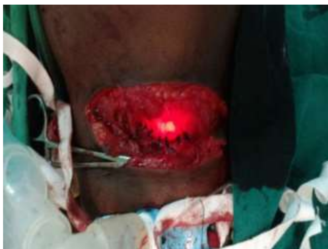
Fig-3: Intra op view (external) after laryngeal framework repair with tip of the fiberoptic scope at the level of laryngeal mucosal defect