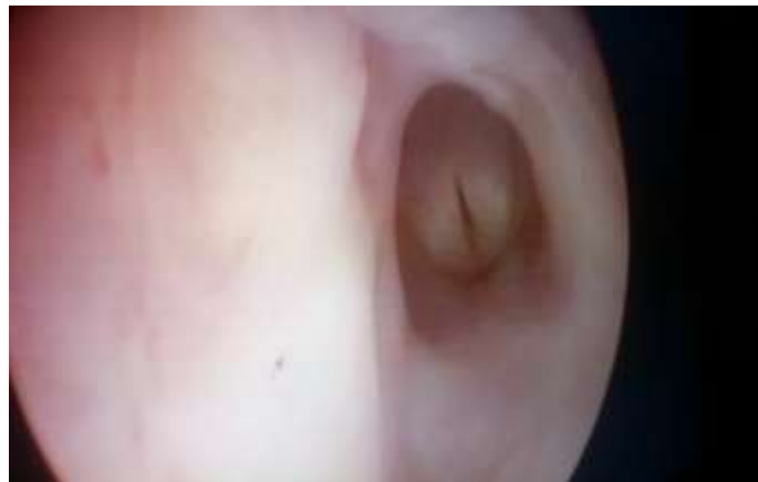
Fig-4: Tracheoscopic view of subglottis on 14 th day with no stitch related granulations