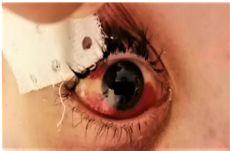
Fig-2: Photo of the right eye showing diffuse subconjunctival haemorrhage, clear cornea and areactive semi-mydriasis pupil secondary to iris sphincter rupture

anterior chamber and areactive semi-mydriasis pupil with iris sphincter rupture at 5 and 11 o'clock. The lens was clear with normal intraocular pressure. The eye fundus examination revealed ischemic and hemorrhagic lesions of macular and peri-macular areas with a normal optic disc. The examination of the left eye was normal.