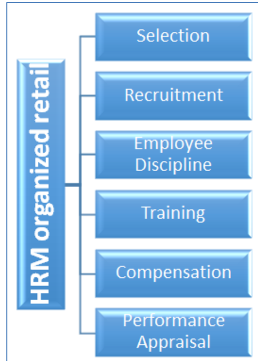
Fig-2: HRM in Organized Retail

Compensation: is the cost of services performed by a worker to an organization. Compensation can directly or indirectly reward me and may inspire workers at all levels.