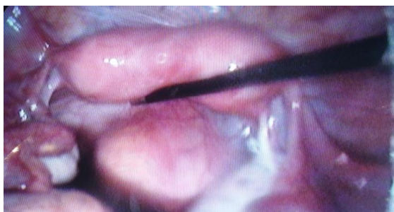
Fig-4: Bicornuate uterus, indentation not complete as in uterus didelphys

Our patient is only 20 year old, with 3 years infertility and an obvious ovarian factor like polycystic ovary syndrome. Since the tubes are patent, we will go for ovulation induction for her if there is no pregnancy for 6 months following laparoscopic ovarian drilling. We will counsel her about the risk of miscarriage and