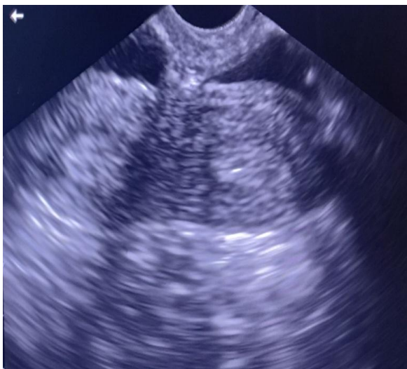
Fig-1: Transvaginal sonogram showing two separate endometrial cavities, suggestive of either bicornuate uterus or septate uterus.

On examination she appears to be of average body weight, with no apparent hirsutism or acanthosis nigricans. On vaginal examination, there was a longitudinal vaginal septum, two cervical openings, the right one easily visible. On transvaginal sonogram, the ovaries appear enlarged and polycystic. There are two separate endometrial cavities (Figure 1).