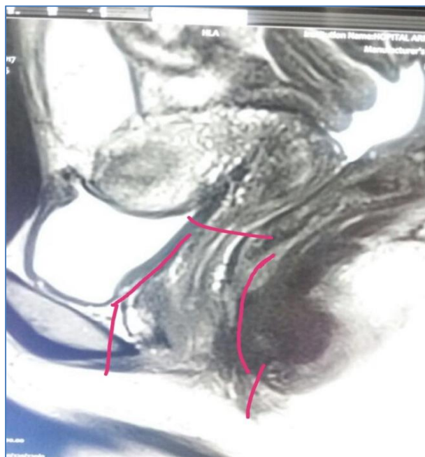
Fig-3: The red marker showing the limits Subtotal Vulvo-Vagienectomy