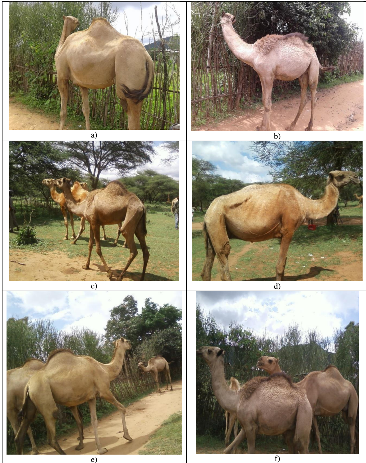
Figure 2: Photos of Camels from Melka Soda (a – c) and Yabello (d - f) districts in the field