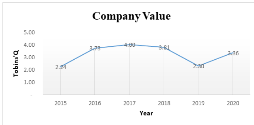
Figure 1: Company Value in the Pharmaceutical Sub-Sector for the 2015-2020 Period Source: IDX (2021)

Figure-1 points that the value of the company during the last five years has fluctuated movements. In 2015 the value of pharmaceutical sector companies experienced a downward trend compared to the following years. In 2015, the beginning of the global economic slowdown affected the decline in company value (CRS, 2021) to 2.24 (IDX, 2021), where the biggest impact was felt, namely the pharmaceutical sub-sector (Kumparan, 2018). The company value in 2015 was still worse than in 2019. The lowest company value in 2015 was owned by TSPC with a value of 0.36 and the highest from MERCK at 4.99. However, in 2016–2017 began to experience an increase where the highest company value was owned by INAF of 11.08 and steadily increased in 2017–2018 with the same value of 14.62. In 2016, the value of the pharmaceutical sub-sector companies increased by 1.49 (IDX, 2021). Furthermore, it experienced a downward trend again in 2018–2019, but in 2020 began to experience recovery again with a reasonably high increase reaching 3.36, but still unable to compete with the company value in 2017 of 4.00.