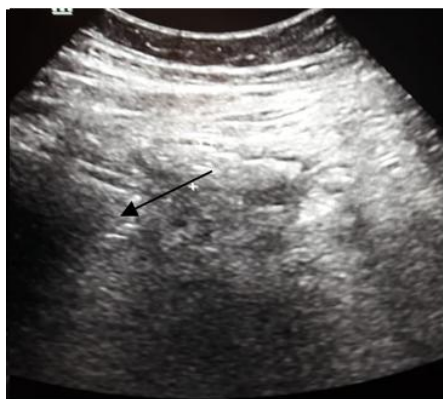
Fig-2: Tumbled appendix at 13 mm with infiltration

She also finds an interest in the demonstration of adnexal or obstetric pathology [7]. It is the 1st choice examination, confirms the diagnosis with a sensitivity of 96 to 100% and a specificity of 92% to 96% [5, 19], this examination remains dependent operator and can be embarrassed in the last two months of pregnancy by uterine repression on the appendix, which would explain the 4 cases of appendicitis not seen in our series (Table-1) [22]. Coeliagnosis has been performed in our series 4 times (Table-2); in cases where the diagnosis was doubtful and the ultrasonography was not fruitful, from where its interest in the positive and differential diagnosis and thus making it possible to avoid white laparotomy [2, 27]. An abdominal CT showing appendicitis peritonitis was performed in one patient after delivery at her 33 WA (Table-1); some authors